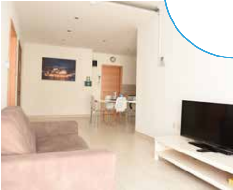
2-bedroom apartment living room